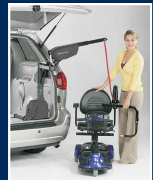
CURB-SIDER® VEHICLE LIFT