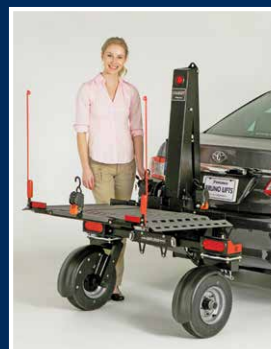
CHARIOT® VEHICLE LIFT