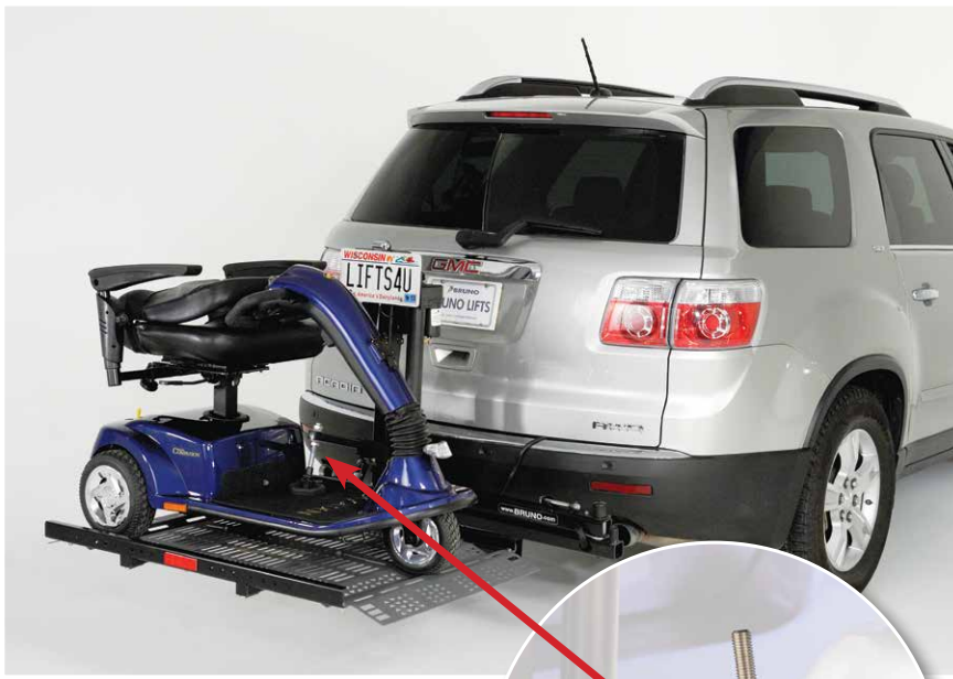
Automatic Securement for Scooters (uses Hold-Tite foot)