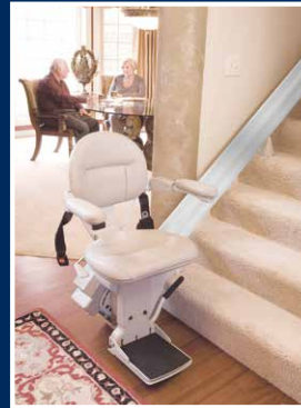
ELITE STRAIGHT RAIL STAIRLIFT