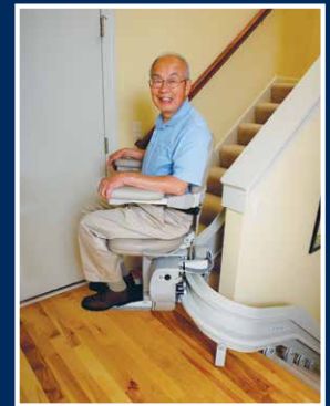
CUSTOM CURVED RAIL STAIRLIFT