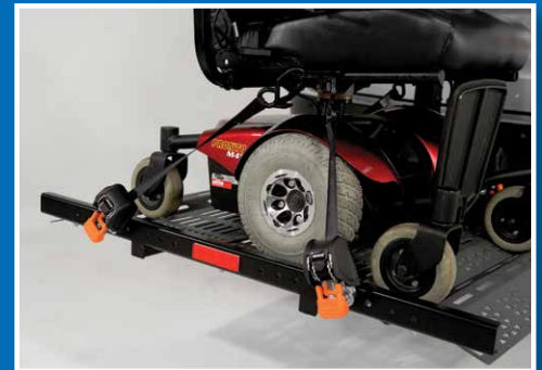
Exterior Grade Securement Belts... for both powerchairs and scooters.