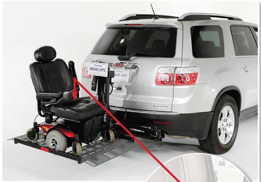
Automatic Securement for Powerchairs (uses Hold-Tite arm)

This easy to use product lifts and stores your unoccupied scooter or powerchair outside your vehicle at the touch of a button. Simply drive or roll your mobility device on the platform, press a button, and let the Out-Sider do the lifting for you. Scooters and powerchairs are automatically secured when lift is raised. Retractable belts are also available for securement.