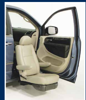
VALET® SIGNATURE SEATING